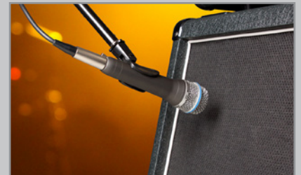
CS2 Instrument Mic Capsule