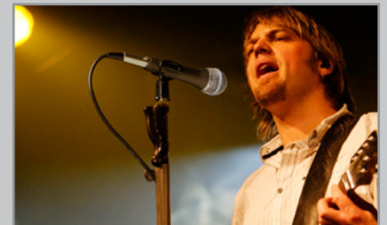
CS1 Vocal Mic Capsule